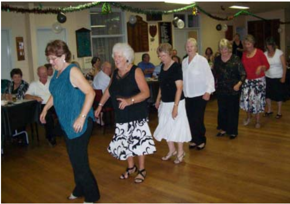
Bootscooters having a hoot.