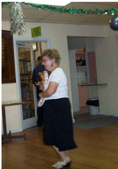
I won a prize in the raffle Yah! Yah!