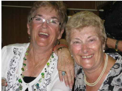
The Tartan Terrors