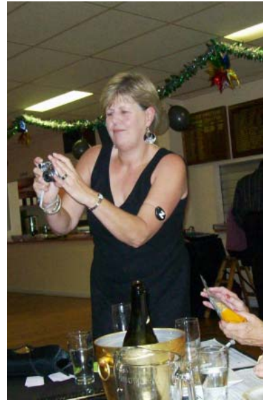
Madam Z not only a good bowler but a photographer as well