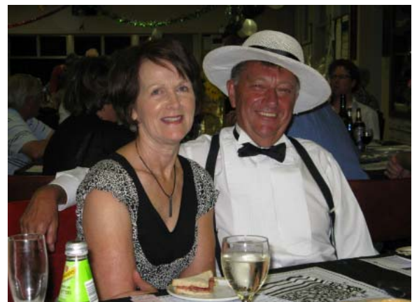
The hat maketh the man!!